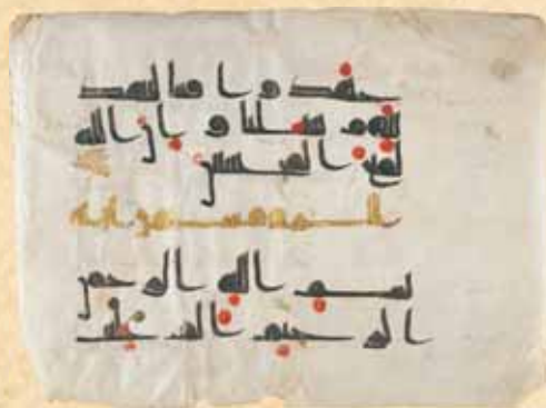
Qur'an. Kufi writing, parchment

The collection of Arabic manuscripts at the IOM RAS includes 10,700 pieces of which 5,200 are in Arabic. Almost all fields of knowledge, all kinds and genres of literature and all stages in the development of Arabic writing are represented in this collection, such as the Qur'an and Qur'anic sciences, Hadith, dogmatic theology, Islamic law, philosophy, philology, lexicography, literature (prose and poetry), history, geography, cosmography, mathematics, astronomy, encyclopedias, science, the occult sciences, medicine, military science, music, etc.