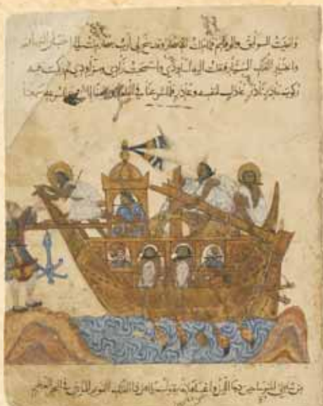
Abū Muhammad al-Qāsim al-Harīrī. Al-Maqāmāt

The collection of Arabic manuscripts at the IOM RAS includes 10,700 pieces of which 5,200 are in Arabic. Almost all fields of knowledge, all kinds and genres of literature and all stages in the development of Arabic writing are represented in this collection, such as the Qur'an and Qur'anic sciences, Hadith, dogmatic theology, Islamic law, philosophy, philology, lexicography, literature (prose and poetry), history, geography, cosmography, mathematics, astronomy, encyclopedias, science, the occult sciences, medicine, military science, music, etc.