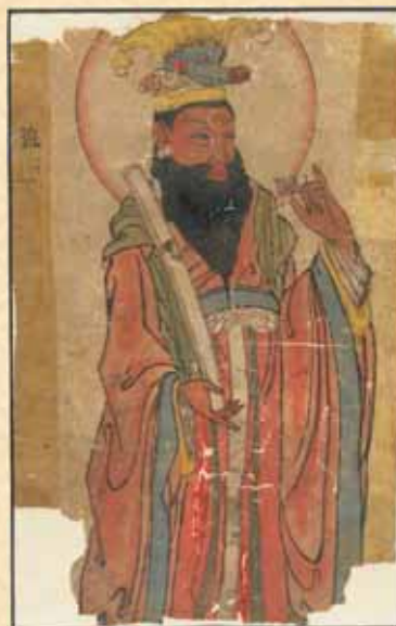
The god of Jupiter planet. Khara-Khoto

The Chinese collection of the IOM, in addition to rare manuscripts and block-prints of the 18th–19th centuries, contains unique literary monuments from the 5th–13th centuries from Dunhuang and Khara-Khoto. The famous library of Dunhuang was accidentally discovered in a walled-up room of a Buddhist monastery in 1900, and today about 15–18% of its manuscripts and documents are kept in St. Petersburg. Written Monuments in the language of the Tangut people, who inhabited the territory of Inner Mongolia till the 13th century, have no corresponding texts anywhere in the world. The collection also provides beautifully decorated manuscripts and albums of military conquests of Emperor Qianlong (18th c.), rare historical and literary works, maps and dictionaries.