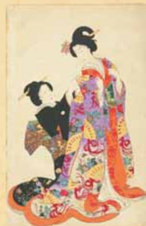
The Great Interior: pictures of everyday life of the women connected to shogun