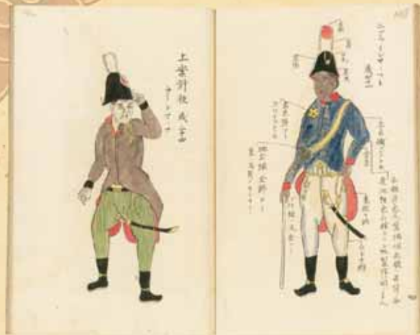
Kankai ibun (Mysterious records of the surrounding seas)

The manuscripts from the collection of the captain of a merchant ship Daykokuya Kodayu laid the foundation of the Japanese collection in the late 18th century. He found his way into Russia following a shipwreck. The most valuable materials are the textbooks and dictionaries, which were compiled by Japanese Gonza in 1736–1739. The separate category in this collection is the literary monuments dedicated to the Russian-Japanese contacts. The exhibition presents the descriptions of Japanese cities and provinces, maps of Japan, the detailed urban plans, the sources about the inhabitants of the Hokkaido and Sakhalin Islands.