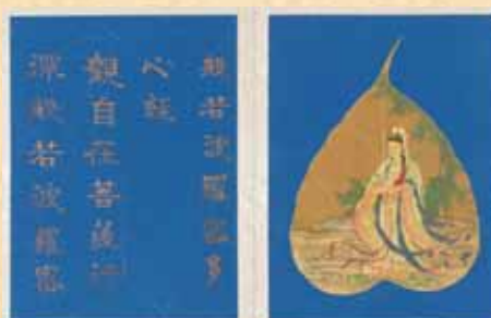
Prajñāparamitā-hṛdaya-sūtra. Miniatures on the bodhi leafs

The Chinese collection of the IOM, in addition to rare manuscripts and block-prints of the 18th–19th centuries, contains unique literary monuments from the 5th–13th centuries from Dunhuang and Khara-Khoto. The famous library of Dunhuang was accidentally discovered in a walled-up room of a Buddhist monastery in 1900, and today about 15–18% of its manuscripts and documents are kept in St. Petersburg. Written Monuments in the language of the Tangut people, who inhabited the territory of Inner Mongolia till the 13th century, have no corresponding texts anywhere in the world. The collection also provides beautifully decorated manuscripts and albums of military conquests of Emperor Qianlong (18th c.), rare historical and literary works, maps and dictionaries.