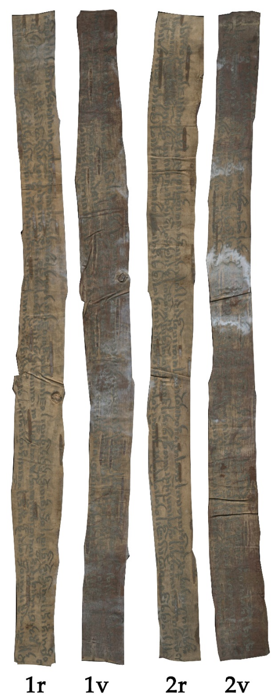
Fig. 4 — Manuscript SI 6618: Verses from the Prātimokṣa Sūtra.