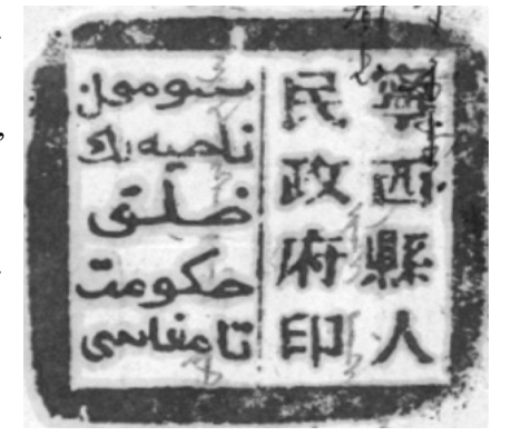
Pl. 2:Ningxi County People's Government Seal

states that: "Other ethnic groups all have handed down complete records of their ethnic histories which are convenient for them to study and research. Yet, up to now the Sibe have no complete history. Please organize special groups to collect historical materials, so that we will be able to teach the history of