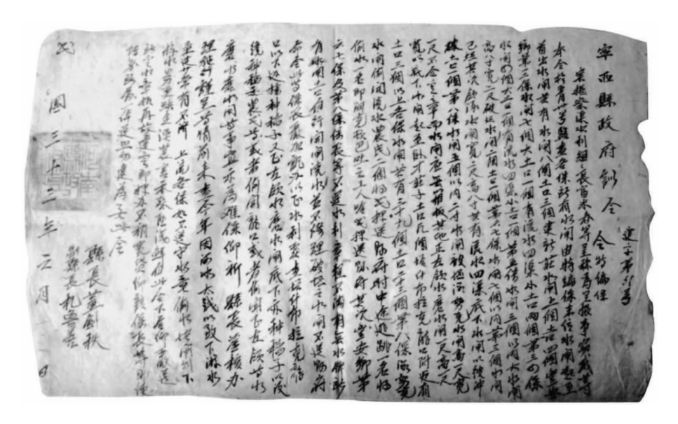
Pl. 1: Henan County Government Seal (GUAN and GUAN 2009)

be appointed by recommendation of the civil affairs department who would promote qualified personnel. The director would be assigned by the council of the provincial government who would reach a decision after deliberation and report this to the Ministry of the Interior for record. Under the command and supervision of the provincial government, these offices would handle all administrative affairs within the area. Within the scope of not contravening the central and provincial decrees, these government offices could issue bureaucratic orders and establish separate rules. This system of the government offices continued throughout the Republic of China period with a total of a hundred and fifty-four administration bureaus established in nineteen provinces, of which the four provinces with the most number of these offices were Heilongjiang with thirty-two, Xinjiang with twenty-eight, Yunnan with seventeen, and Qinghai with thirteen.<sup>27</sup> Those offices established in Xinjiang included the Henan Administration Bureau whose predecessor was the Sibe camp. In 1937, the Sibe camp area was separated from Yining County to be set as the Henan Administration Bureau. This area was located south of the Ili river, so the government office established there was named Henan meaning "south of the river". In the 28th year of the Republic of China, Henan County was set up. (see Pl. 1) Then it was renamed Ningxi County in the