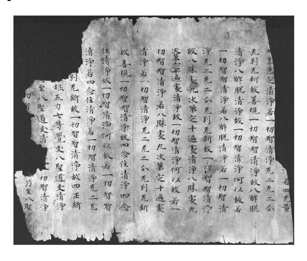
Fol. 1. SI 6621 recto