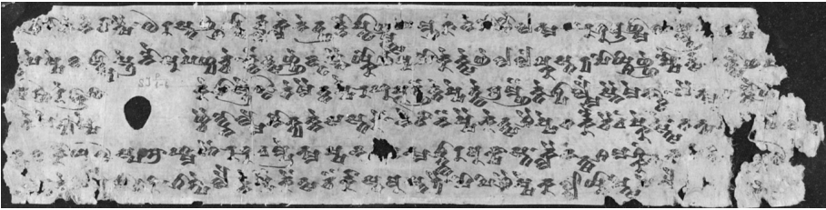
Pl. 2. SI P/1 (SI 1903), verso