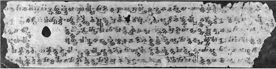
Pl. 3. SI P/2 (SI 1904), recto